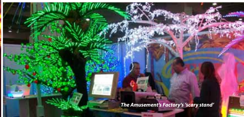
The Amusement's Factory's 'scary stand'