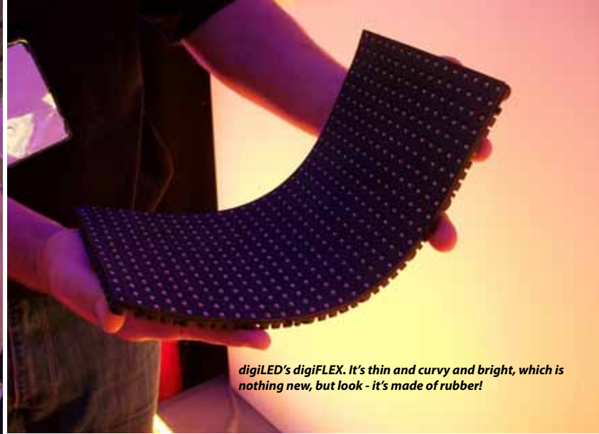
digiled's digiFLEX. It's thin and curvy and bright, which is nothing new, but look - it's made of rubber!