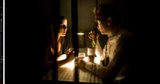
Ontroerend Goed provided one of the festival's highlights: 'Internal'.