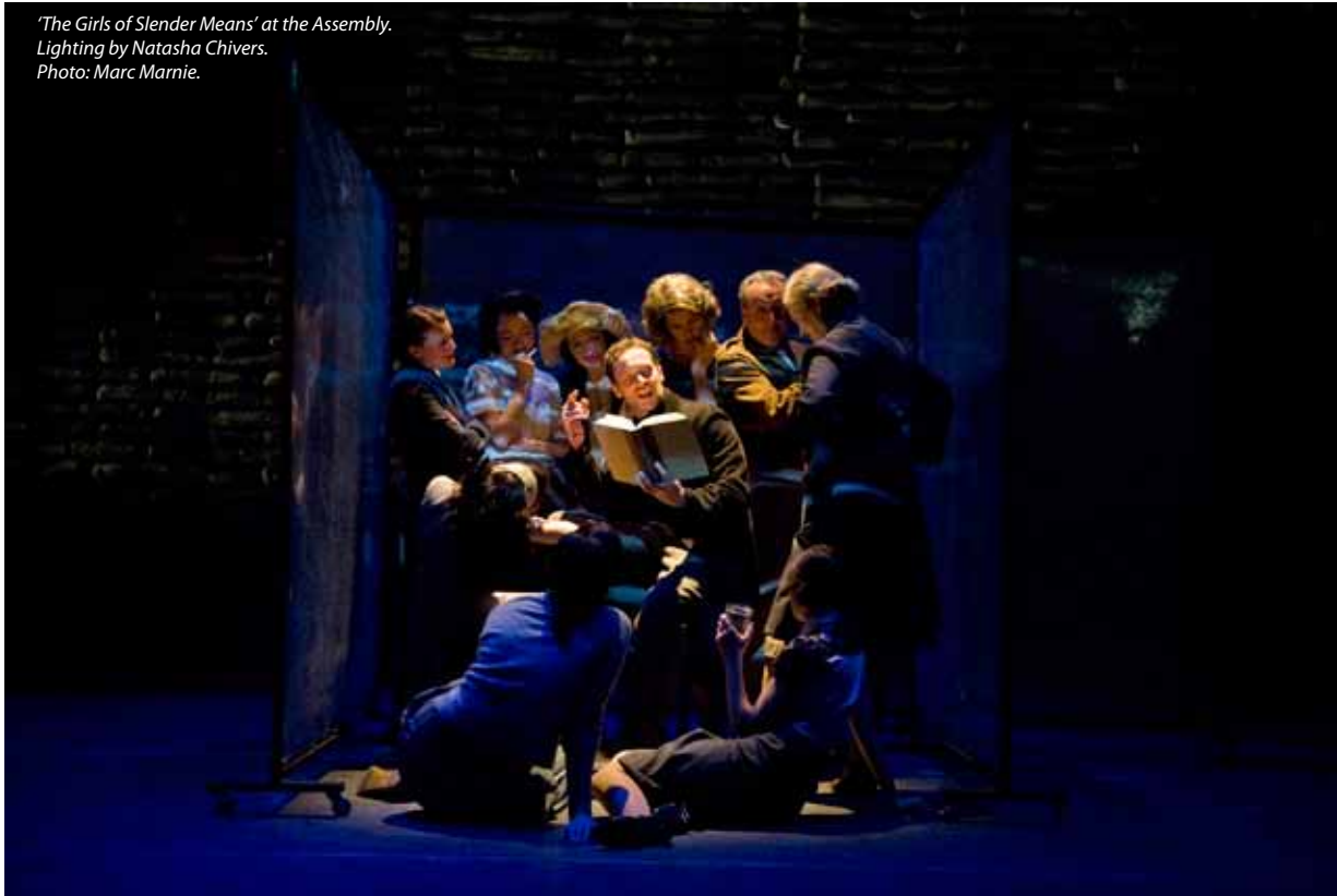
'The Girls of Slender Means' at the Assembly. Lighting by Natasha Chivers. Photo: Marc Marnie.

But we forget (or rather, I do) that lighting plots can be stored on the boards and re-booted at the flick of a switch. Still, it's unusual to find a production where the lighting input is given much house-room. Muriel Romanes' production of Muriel Spark's The Girls of Slender Means at the Assembly was a notable exception, with shifting locations and indeed mental states indicated by a design of translucent screens, and