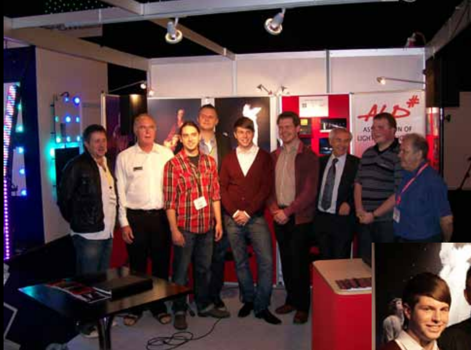
The Michael Northen Bursary judges and winners.